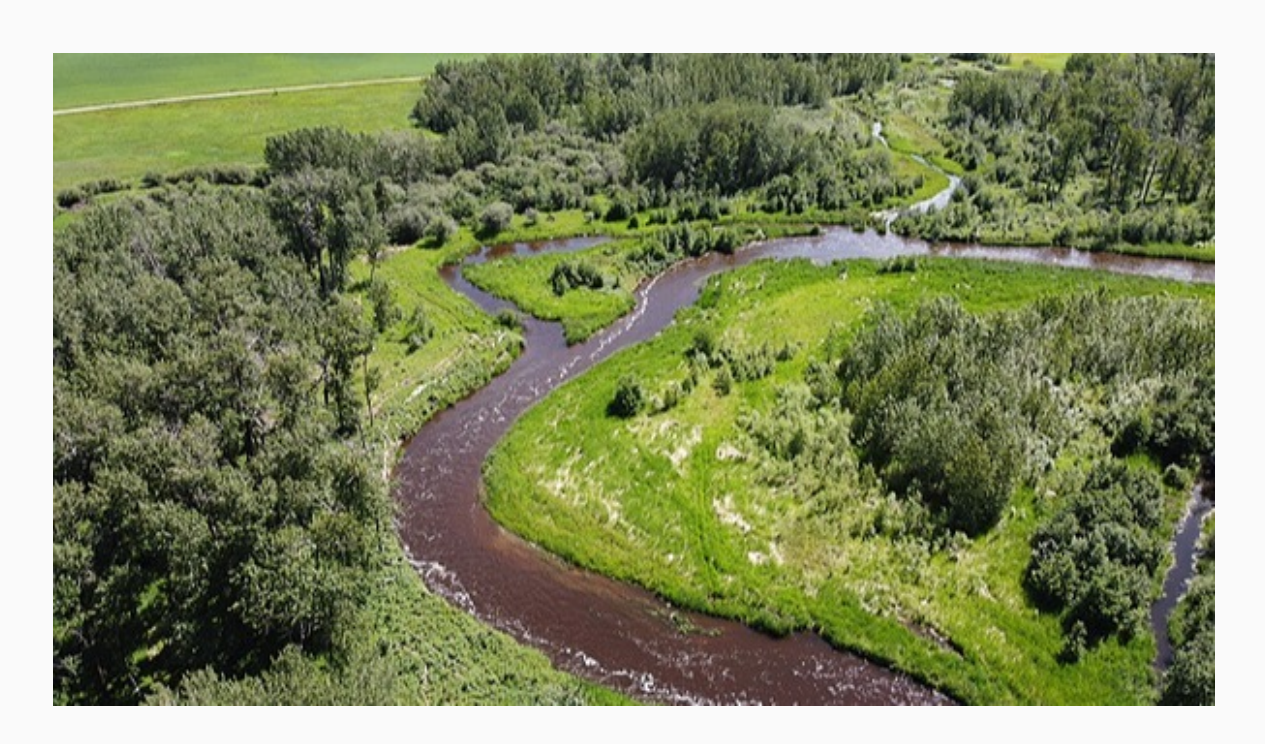
The watershed received significant rainfall early in the summer, which led to high water levels in the battle river. All precipitation is welcome!