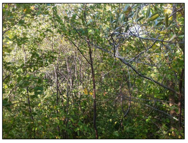
Figure 8. It is no longer possible to tell which species were planted and which came in naturally in this 14 year old Eco-Buffer.

Establishing an Eco-Buffer is more complex than establishing a shelterbelt. It is also more expensive, requiring around twice the number of seedlings for a given length. However, the benefits of the initial investment are significant, and will begin to be felt as maintenance is phased out after two years. At this point, the site should increasingly become "captured" by suckering trees and shrubs that shade out weeds and provide shelter for slower growing long-lived trees. As the Eco-Buffer continues to mature, a diversity of birds, small mammals, insects, and soil microbes will take up residence and spread seed, pollinate, and cycle nutrients both within it and in the surrounding landscape. If the Eco-Buffer is well designed, after about ten years it will be difficult to tell that it was in fact a planted Eco-Buffer and not a remnant strip of natural forest running through your land.