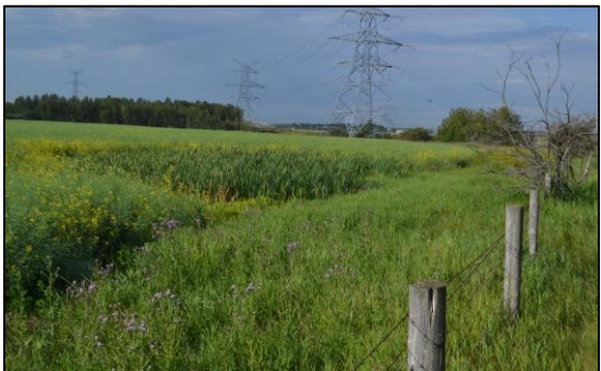
Figure 3. Potential Eco-Buffer site (AWES Photo).