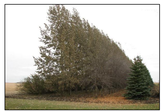
Figure 2. Conventional shelterbelt

Eco-Buffers are plantings of perennial species (i.e. trees, shrubs, and/or herbaceous) designed to mimic natural forest habitat that provides specific ecosystem services. The Eco-Buffer concept was developed by agroforestry researchers at the Agriculture and Agri-Food Canada Agroforestry Development Centre in Indian Head, SK. The researchers found that if designed well, an Eco-Buffer, like the natural forest it mimics, can provide many ecosystem services at once and continue to sustain itself in the long-term with minimal ongoing maintenance (Schroeder, 2012). These are some advantages that Eco-Buffers have over more well-known shelterbelts (Figure 2), which are usually rows of trees and shrubs of a single species designed specifically for the