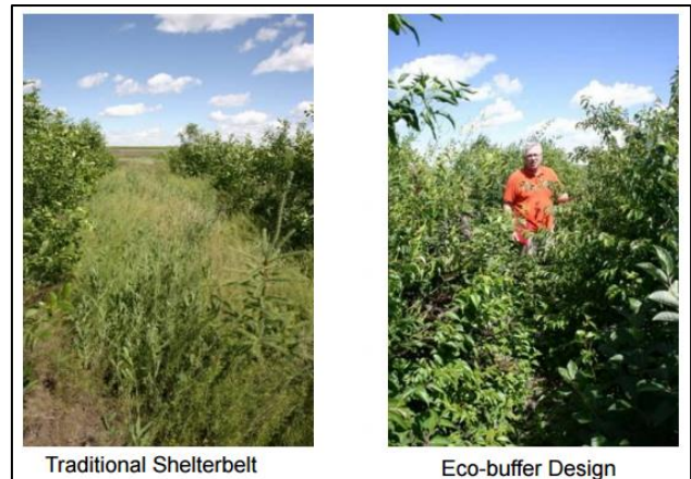
Figure 7. 5 years after planting a shelterbelt (left) and an Eco-Buffer (right). Suckering species have completely filled in Eco-Buffer rows