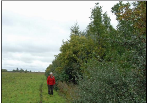
Figure 1. 3-row Eco-Buffer in Francis, SK, 16 years old (AAFC Photo).

The easiest and most effective way to ensure that these services are present on your farm or property is to protect and sustainably manage existing natural forest habitat. However, it can also be beneficial to add forest habitat to areas where certain services are desired. Establishing an "Eco-Buffer" is one way of doing this (Figure 1).