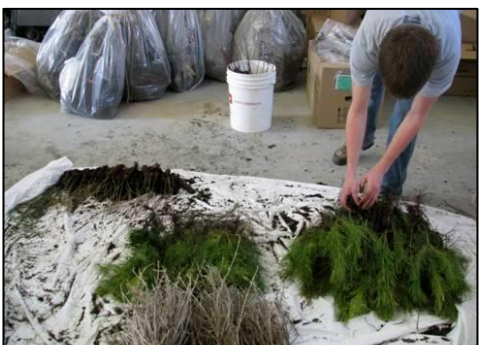
Figure 6. Sorting bare root stock into appropriate species types (AAFC Photo).

3. Plant "location-specific" species (if planting by hand) <sup>1</sup>. appropriate species types (AAFC Photo). Begin by planting species that have a specified place in your design. These will likely include long-lived trees planted every 6 meters along each row, and shorter shrubs planted on the outer rows. Depending on your design, they could also include high-value species (e.g. fruit producers) that require specific microhabitats, or clumps of flowering species planted together to facilitate pollination.