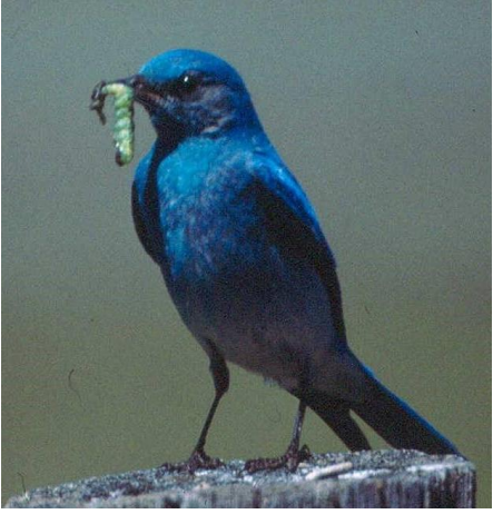
Figure 1. Mountain bluebird.

55" of pine board (1"x6") 9" of pine board (1"x10") Saw to cut boards 16 deck screws (1 ½") 1 brass screw (1 ¼") 1 chisel (1/2") 1 hole saw or forstner bit (1 <sup>9</sup>/<sub>16</sub>") – drill press makes this easier 1 drill with <sup>1</sup>/<sub>8</sub>" and <sup>3</sup>/<sub>8</sub>" drilling bits, and screwing bits