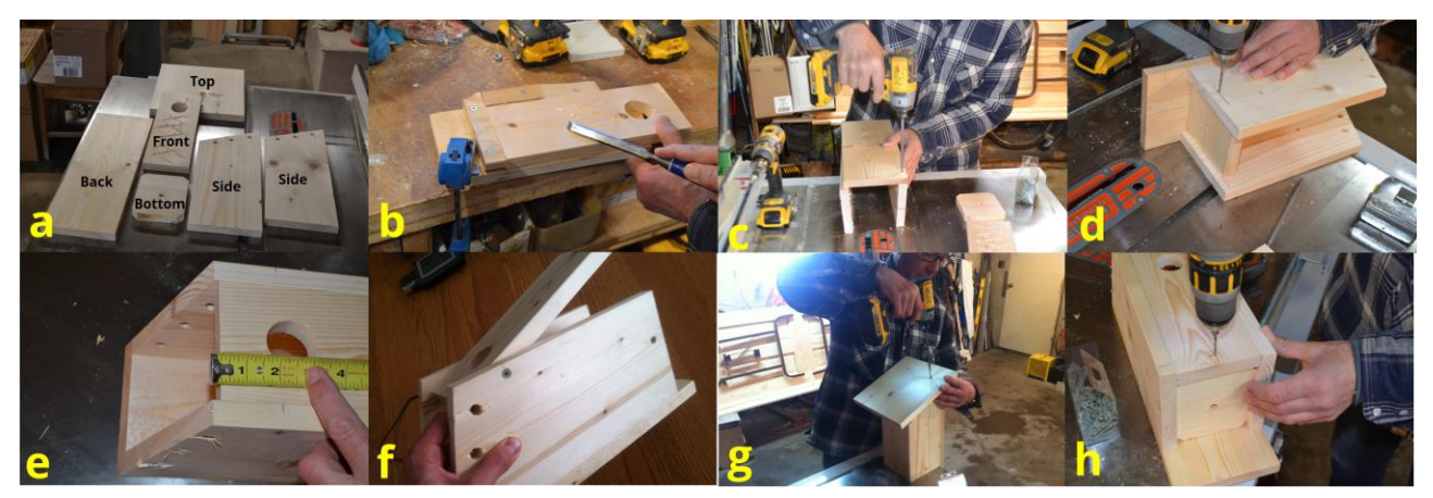
Figure 2. Images of select steps to building the bluebird house.